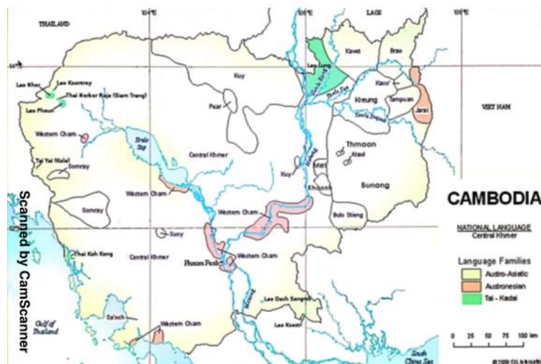
Figure 2: Ethnolinguistic Groups in Cambodia